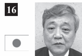
16 Japan (Toyama) Inami Woodcarving Cooperative Society 124 Artists