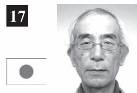
17 Japan (Toyama) The Artist Society of Inami Town 51 Artists